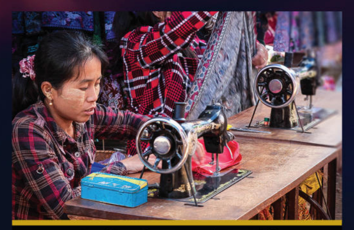
Female employees comprise 86% of the workforce in the garment industry.

The dominant strategy favoured by the remaining businesses in the garment industry was to suppress wage