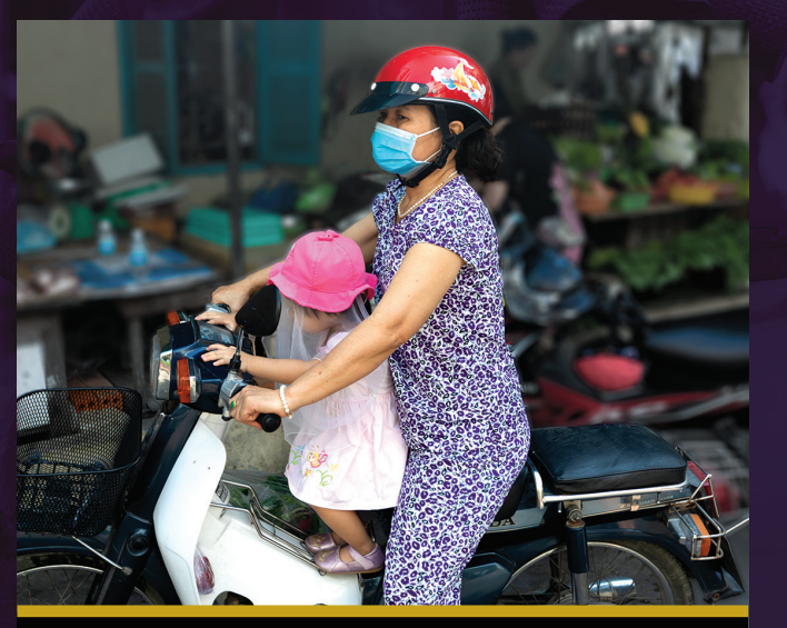
Female-headed households experienced poorer recovery compared to male-headed households.

Problems facing all households, but especially those headed by women, were a lack of connection to online support, and weak access to the social protection system.